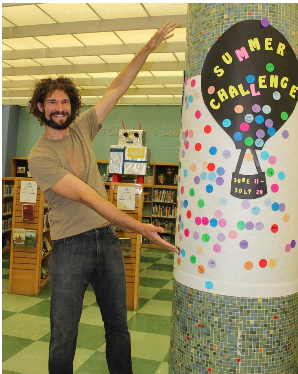
Chicago Bulls player Robin Lopez, stands next to a pillar at the Fresno County Public Library's Doris Gates Room that lists children participating in the current Summer Reading Challenge.

2420 Mariposa Street / Fresno, California 93721-2285 / (559) 600-6237 / Fax (559) 600-7628